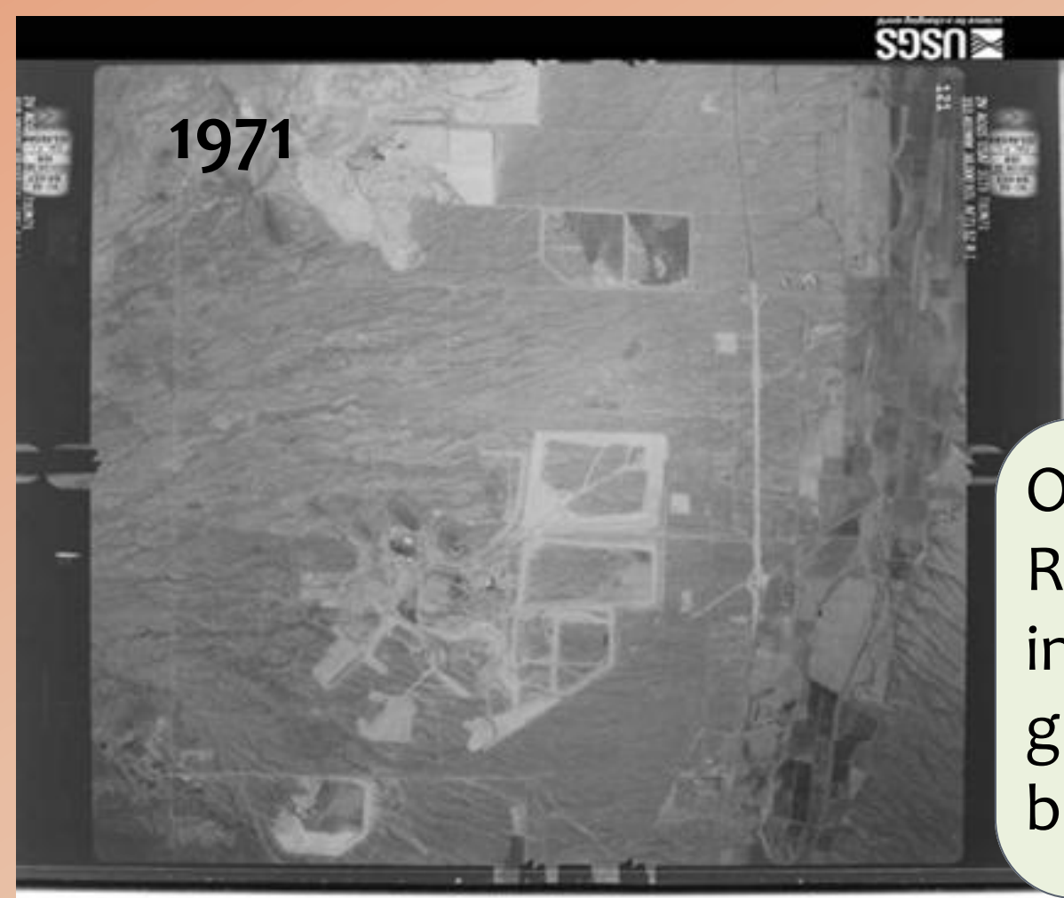
US Air Force

Open Pit Mining: Rock is stripped away in a deepening pit to get at the copper ore below.