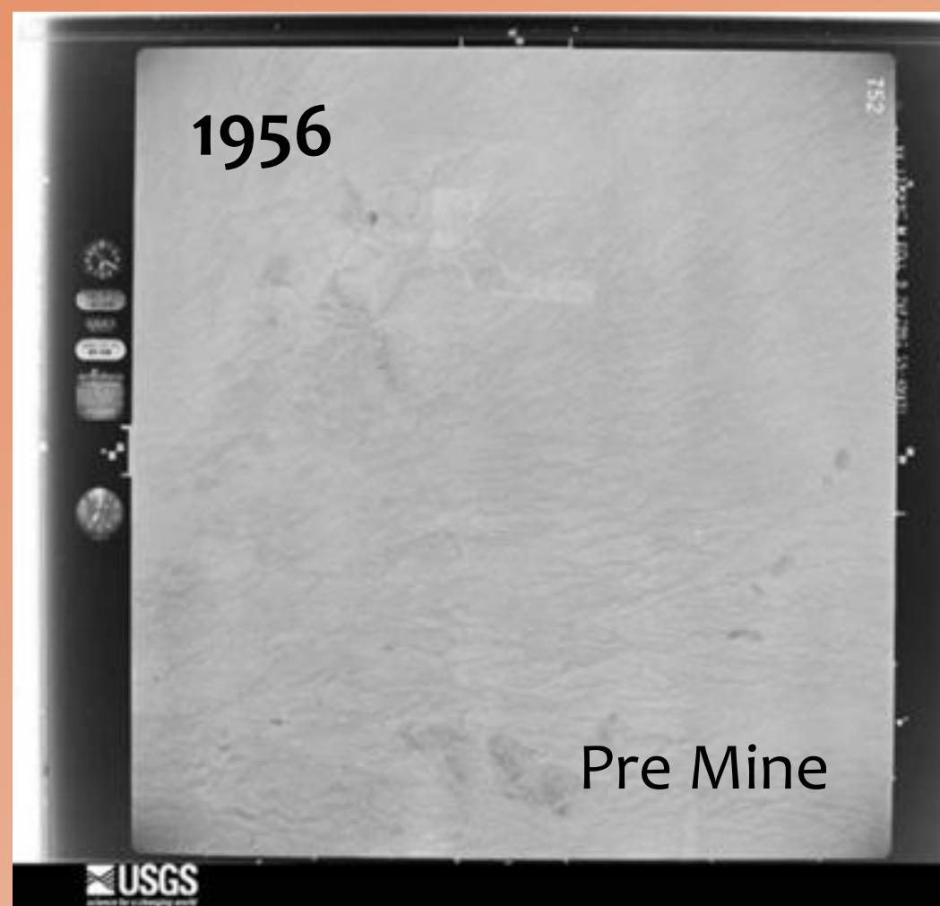
Army map service