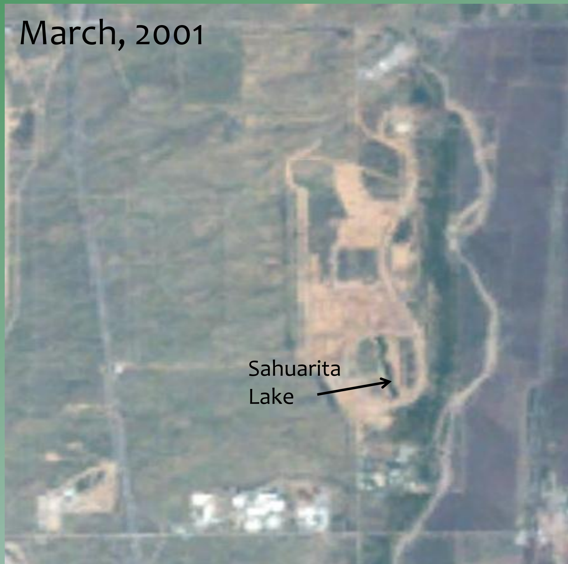
This landsat image captures Rancho Sahuarita before most of the new construction took place.