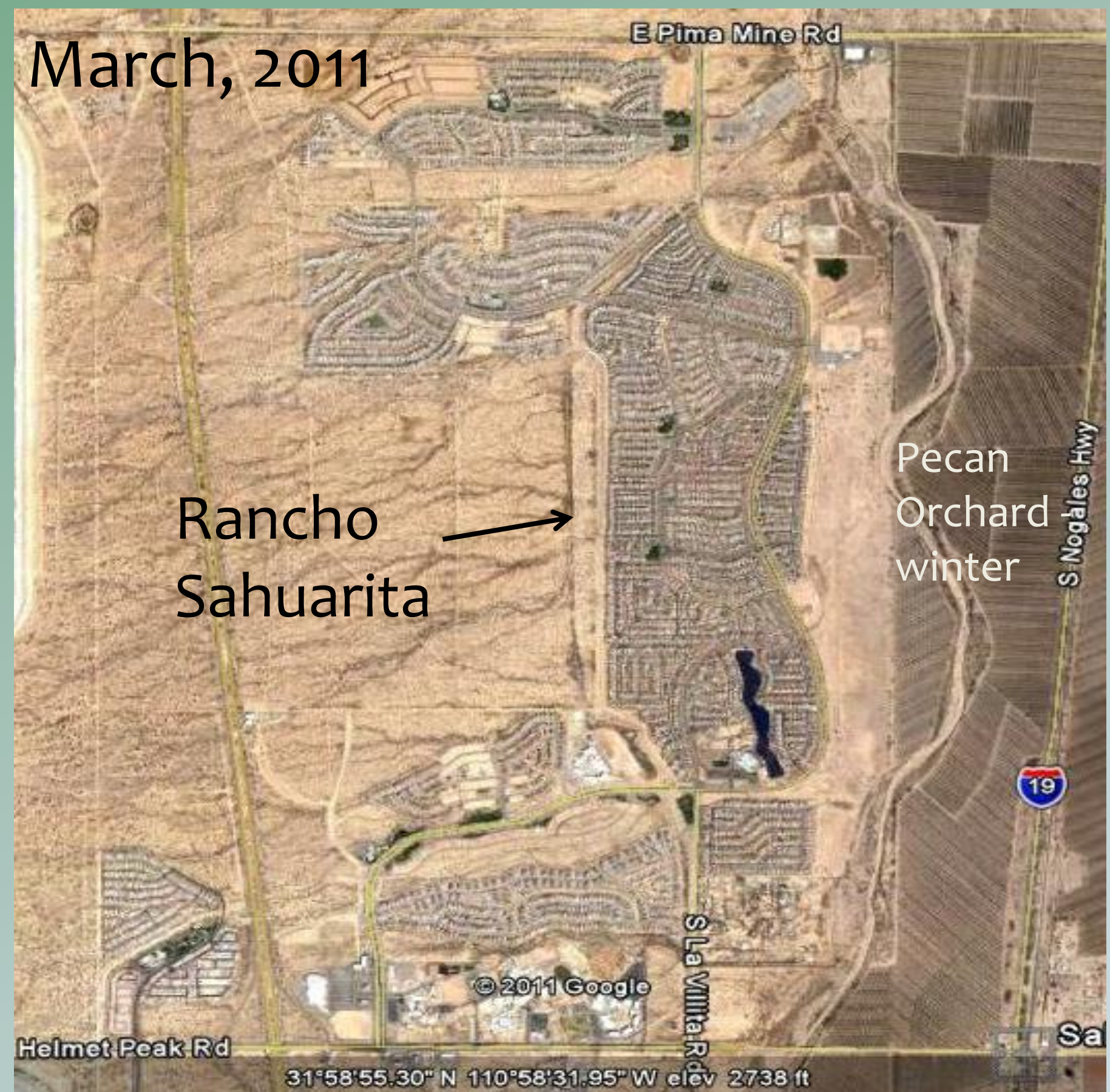
This image from 2011 clearly shows new housing developments in the area. The image is sharper due to improvements in remote sensing technology.