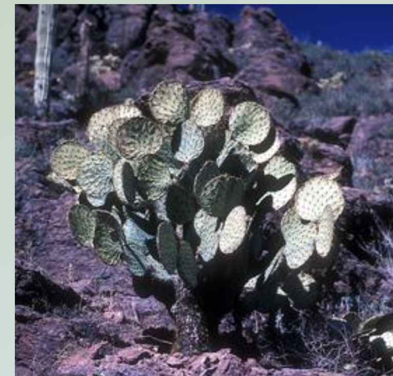
Opuntia chlorotica

If you're not from the Sonoran Desert, you probably think that it has one long, insufferably hot summer. However, residents know that summer has two very different parts: the Arid Foresummer in May and June, and the Monsoon Season from July through September. During the Monsoon Season , moisture-laden air sweeps up from the Gulf of California, bringing rejuvenating rains to the parched desert. In this short period of time the Sonoran Desert can receive more than half of its total yearly rainfall. This moisture brings a growing season that sustains the desert for months.