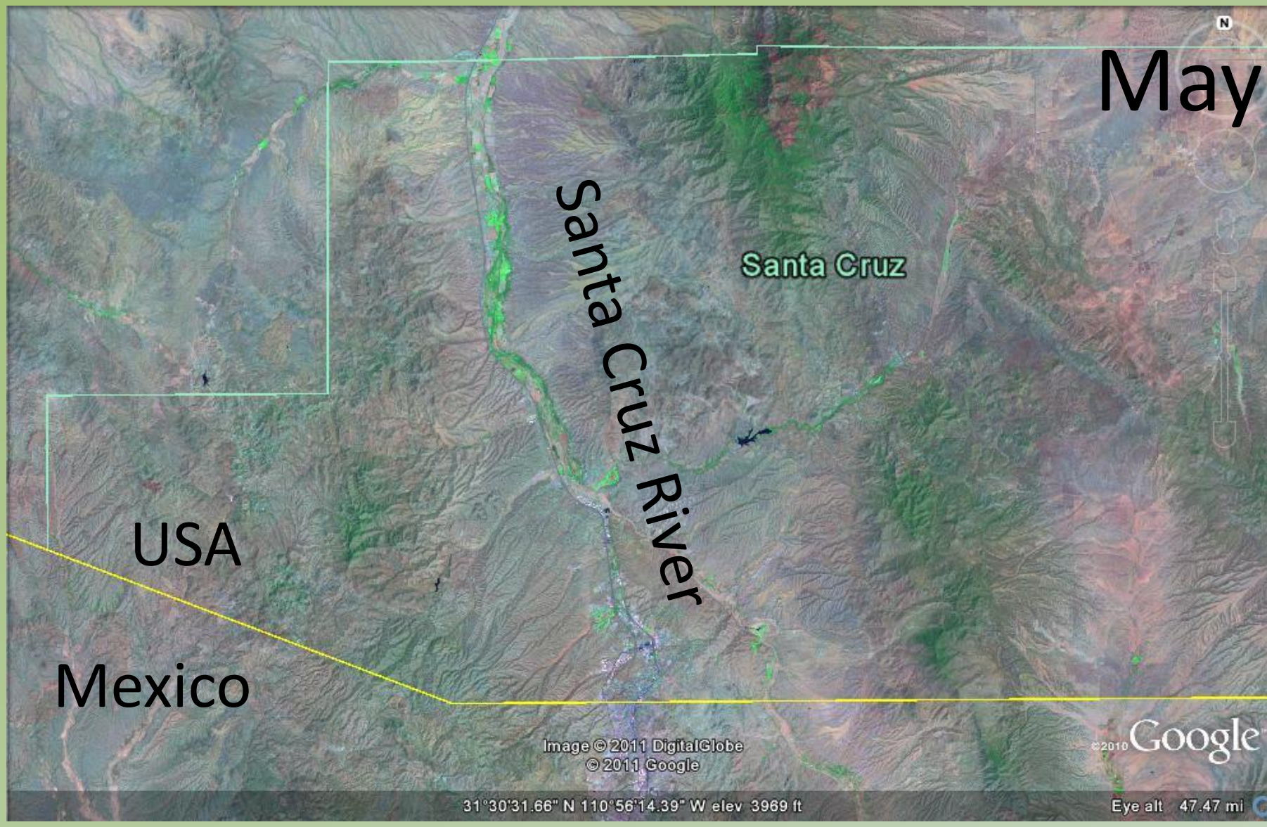
Area around Santa Cruz River, south of Tucson, May 2006 The lack of bright green coloration in this false-color Landsat image illustrates the dry conditions of the arid foresummer.

The bright green color in these false-color Landsat images highlights healthy vegetation. Why did the landscape change color between May and August?