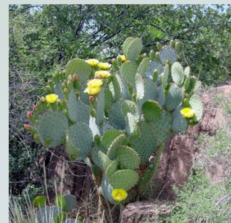
Opuntia chlorotica