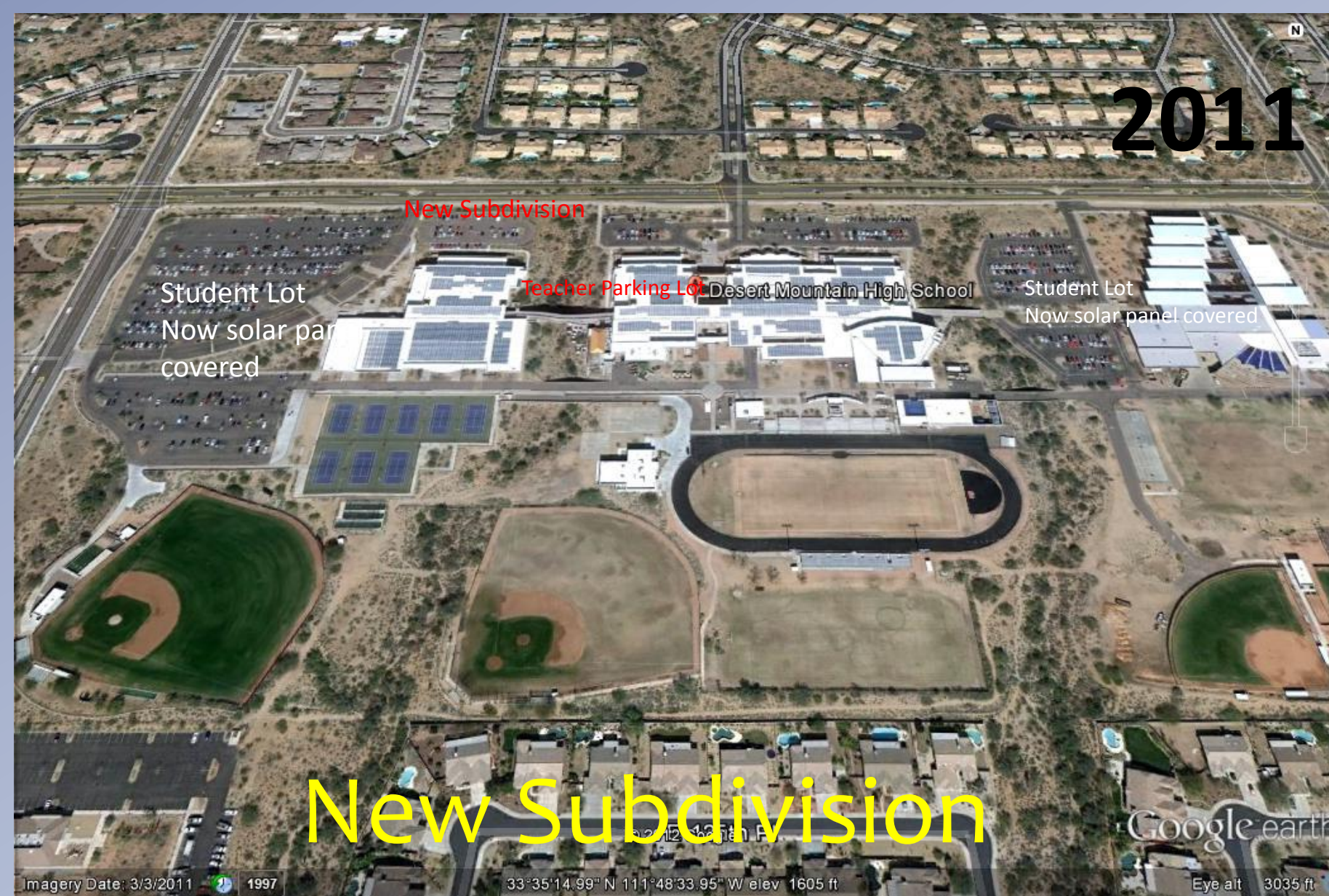
124 th and Via Linda, Scottsdale, AZ Google Earth 3/31/2011