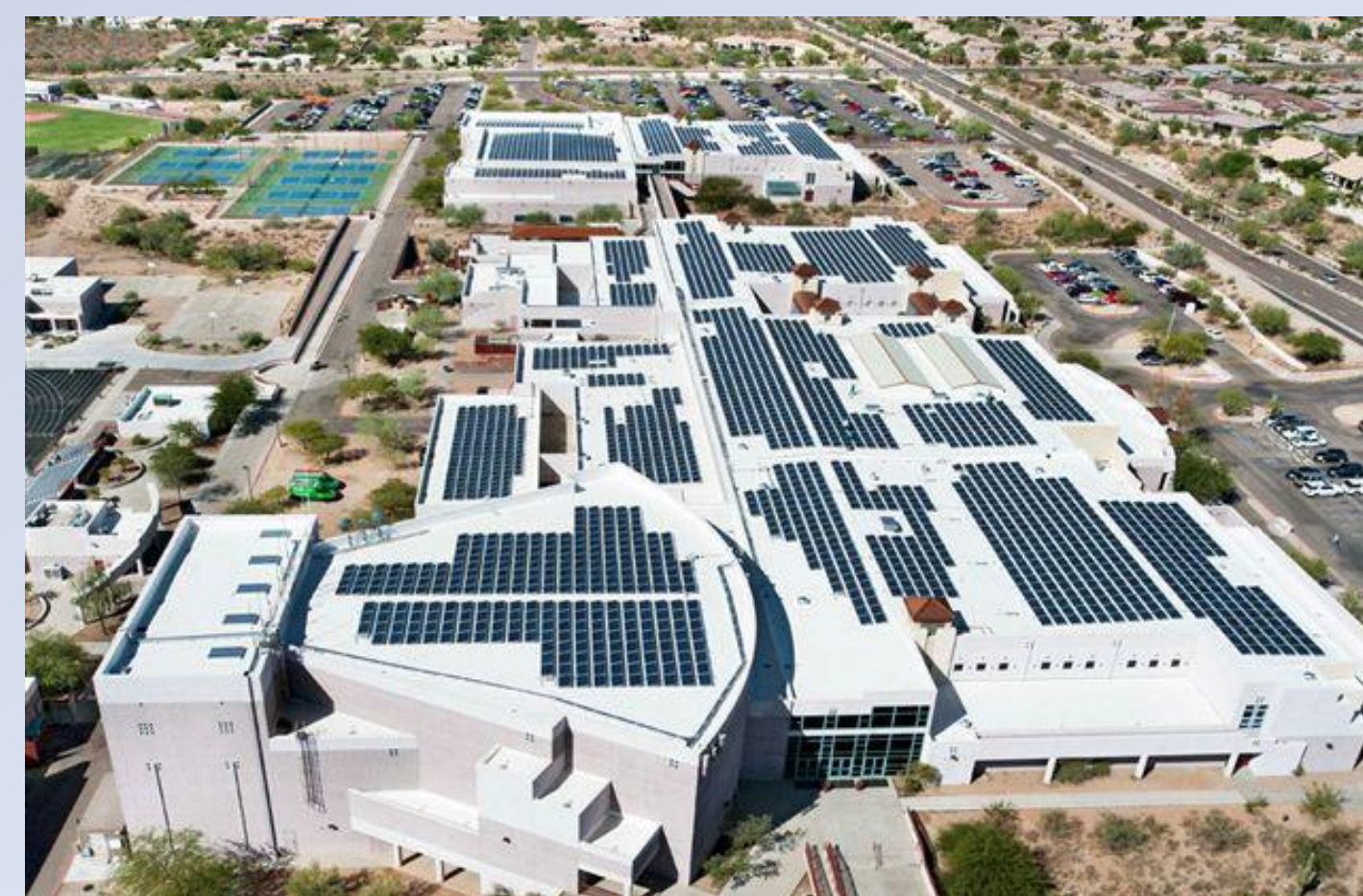
Desert Mountain High School with solar panels installed.

The City of Scottsdale also produces energy through photovoltaic panels on multiple city facilities. They produce enough energy to power 68 homes, reducing nearly 1 million pounds of CO 2 emissions. Desert Mountain High School installed photovoltaic cells on its roofs in and parking lots.