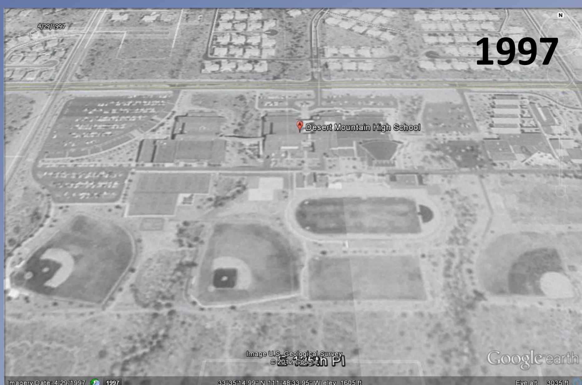
124 th and Via Linda Google Earth 1997

By 1995 this pristine area was covered with four new subdivisions, two churches and Desert Mountain High School. In 2007 another swath of desert was taken over for teacher parking. What is being done to maintain or restore the natural environment?