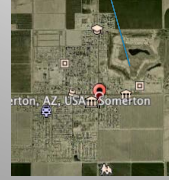
City of Somerton 2000

Population density in the year 2010 10,828 per square mile