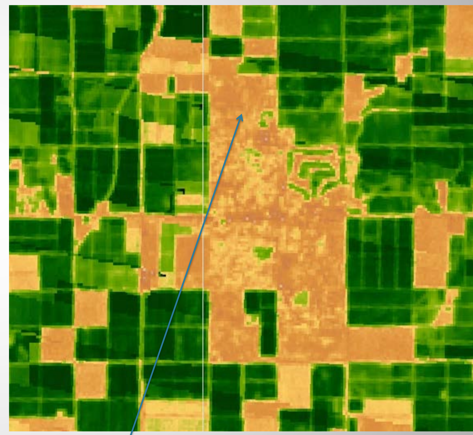
Landsat image of Somerton as it appears in 2013. Much of the farmland has been converted to residential.

Population density in the year 2010 10,828 per square mile