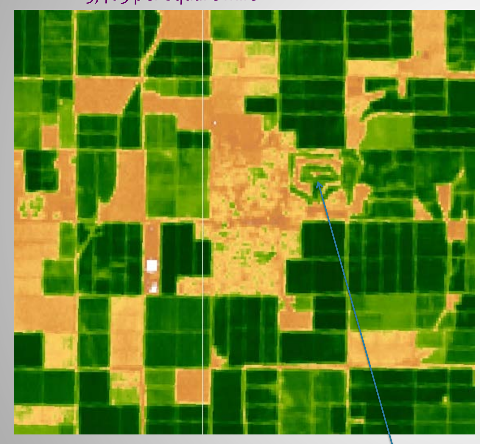
Landsat image of Somerton as it appeared in 2000. The town is surrounded by agriculture (Green indicates vegetation and yellow indicates nonvegetated areas).

Population density in the year 2000 5,483 per square mile