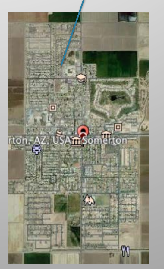
City of Somerton 2013

Landsat NDVI images accessed courtesy of Google Earth Engine's Trusted Tester program.