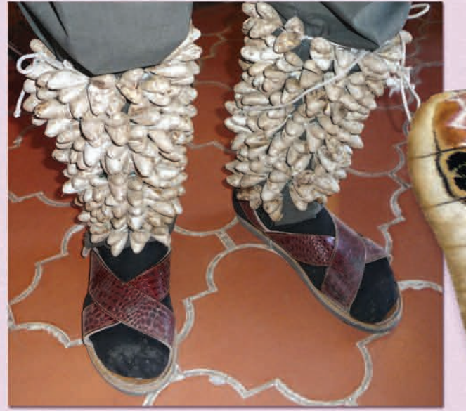
Above: Yaqui rattles made from silk moth cocoons. Right: Adult cincta silk moth (Rothschildia cincta)

Sometimes it isn't the insect itself that catches our attention, but rather it's the signs of their presence. Many insects are highly skilled architects that create structures either to protect themselves or to protect their young. For example, praying mantids make elaborate egg cases that house dozens of eggs and developing larvae, and butterflies and moths make chrysalises and cocoons, respectively, in which the caterpillar (the larva) becomes a pupa and the pupa becomes an adult. One of the most characteristic cocoons of the Sonoran Desert Region is that of the silk moths (such as Rothschildia cincta). These caterpillars spin a cocoon of silk on desert shrubs, which Native American groups in Arizona and Mexico have used for rattles of various kinds. Another familiar insect structure in the Sonoran Desert Region can be seen on prickly pear cacti (Opuntia spp.). Cochineal scales are tiny insects that suck juices from prickly