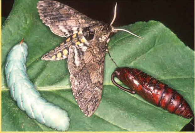
omplete life cycle of tobacco hornworm (Manduca sexta)-caterpillar left), chrysalis (right) and moth-closely related to and often confused with the very similar tomato hornworm ( M. quinquemaculata ). Both hornworm species feed on tomatoes, tobacco, and other plants of the amily Solanaceae

anthills and see which foods they prefer. Set out a pan with a small amount of honey, molasses, or sugar water, or cut fruit to lure butterflies, moths, and flies.