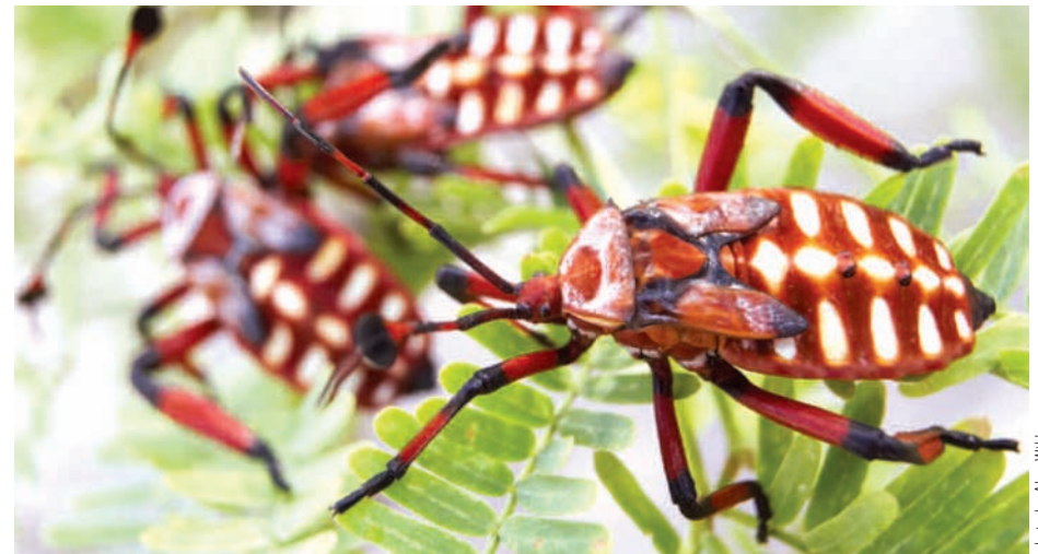
Giant mesquite bug nymph (Thasus neocalifornicus)

Palo verde root borer (Derobrachus hovorei,