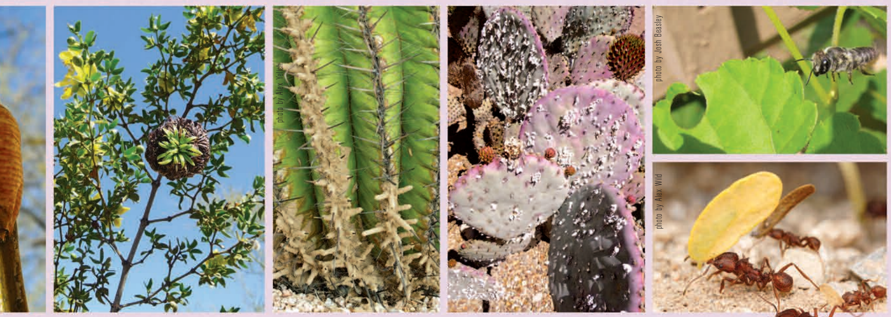
From left, first photo: Egg cases of mantids are often found attached to tree stems. Second photo: Creosote gall made by the creosote gall midge (Asphondylia auripila) Third photo: Shelter tubes of the long-jawed desert termites (Gnathamitermes perplexus) on a barrel cactus. Fourth photo: Cochineal scale made by the scale insect Dactylopius confusu on a prickly pear cactus. Fifth photo (top): Leafcutter bee (Megachile sp.) in mid flight and leaf with circular hole it cut. Sixth photo (bottom): Desert leafcutter ants (Acromyrmex versicolor) carrying their burdens. Cut out photo: Desert leafcutter ant.

The creosote gall is a familiar sight in the Sonoran Desert. Like all galls, these are the products of a collaborative effort between a plant and an animal; the visible structure is an abnormal growth of plant tissue caused by a parasite. In the case of the creosote gall, the structure is caused by the feeding activity of the larva of a small fly known as the creosote gall midge (Asphondylia auripila). The burrowing larva induces the creosotebush (Larrea tridentata) to form a strange globular growth and the larva develops inside this protective tissue. Leafcutter bees (Megachile spp.) circular leaf pieces are used to create origami-like nest chambers, which they fortify with pollen and in