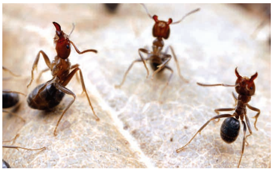
Worker ants (Liometopum apiculatum) in alarm posture. The immature queens of this species are savore in some Mexican communities.

Tohono O'odham men, women, and children collected makkum during the caterpillar's wandering pre-pupation phase. After removing the head and viscera, the larvae were traditionally roasted over hot coals and either eaten immediately,