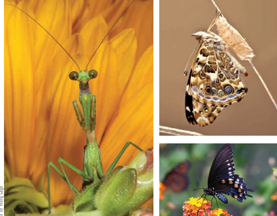
Above: California mantis (Stagmomantis californica). Top right: Painted lady (Vanessa cardui). Above right: Pipevine swallowtail (Battus philenor).