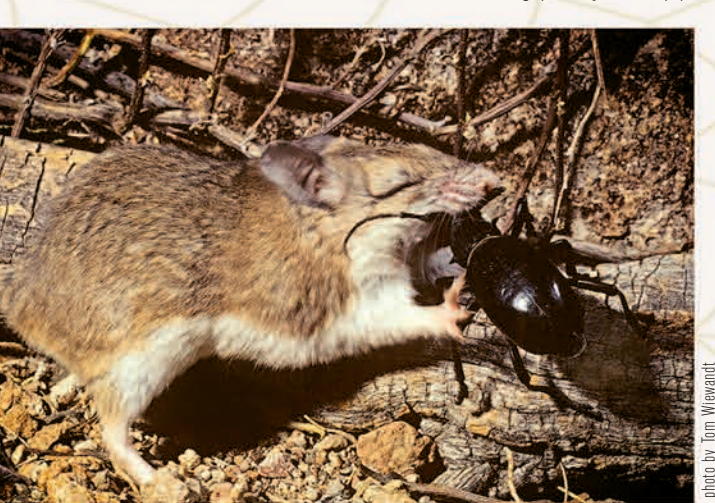
Grasshopper mouse (Onychomys torridus) with a cactus longhorn beetle (Moneilema gigas).

Insects that can detect bat hunting calls are 40 percent less likely to be eaten by bats than those that lack that ability. One important advantage that these insects have is that they can detect a bat at about 40 meters, while the bat probably won't detect the insect until it is within 10 meters, thus allowing the insect to escape before the bat detects it. But life continually evolves new strategies, and some species of bats can adjust the frequency of their echolocation call above or below the frequency its insect prey is able to detect. (An interesting wrench in this aerial dogfight is that tiny mites occasionally invade an insect's "ears," decreasing its ability to detect a bat's sound pulses.) Pallid bats (Antrozous pallidus) have hearing so sensitive that they can detect the scuffling sounds of insects or scorpions walking on the ground. The pallid bat, and some other bat species as well, use sound to locate prey in much the same way that barn owls listen for their prey. Big brown bats (Eptesicus fuscus) will listen to the calls of frogs to locate a wetland habitat with numerous insects. Luckily, the supply of insects is almost inexhaustible.