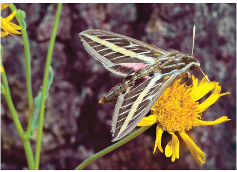
White-lined sphinx moth (Hyles lineata)

Another insect food source in central and southern Mexico is a species of ant (Liometopum apiculatum) whose immature queens are eaten by people in the states of Michoacan, Pueblo, and Zacatecas. These ants are approximately 80 percent protein; they also surpass the United Nation's Food and Agriculture Organization's recommendations for many essential amino acids.