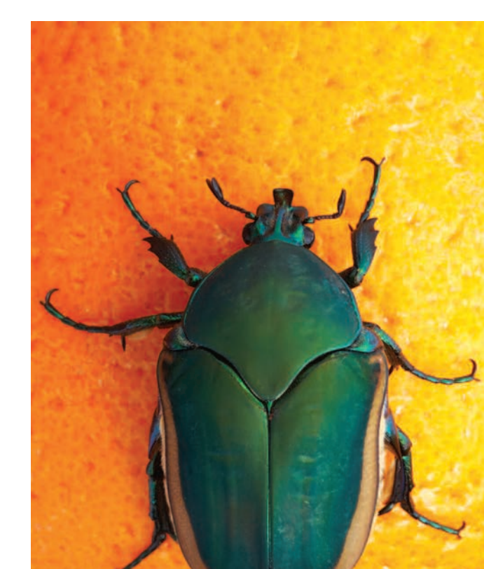
Green fig beetle (Cotinus mutabilis)

from members and visitors, we've explored a range of topics over the past decade, including large-scale conservation challenges like invasive species, ecosystems of the Santa Cruz River and the Sea of Cortez, the gustatory pleasures and health benefits of local foods (and production techniques that support a healthy environment), and an in-depth look at the charismatic jaguar and the people working on both sides of the U.S.-Mexico border to ensure its survival in the wild. In this issue, we focus on insects of the Sonoran