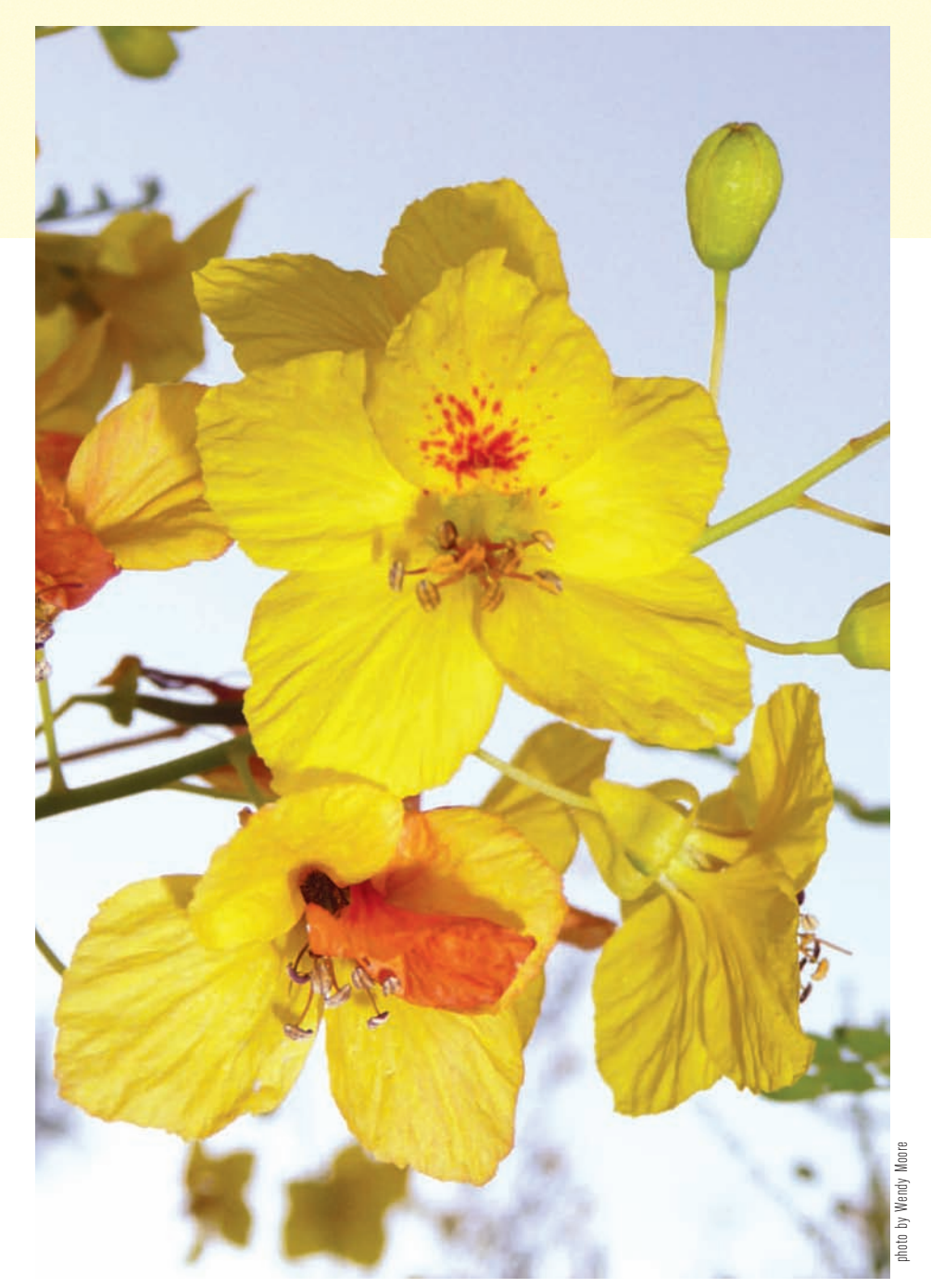
Mexican palo verde flowers ( Parkinsonia aculeata ). The upper flower has not yet been pollinated; the lower flower has, as indicated by the color change and the droop of the 'banner petal.'

Another interesting plant-insect interaction has also fostered insect biodiversity—herbivory. Herbivores get their energy by eating plants. In response to this predation, plants have evolved a huge number of bitter and toxic chemicals that deter animals from eating them. Why a huge number? Because herbivorous animals are continually evolving, too, developing tolerances to the toxins. Because of the typically short time span between generations, insect species develop