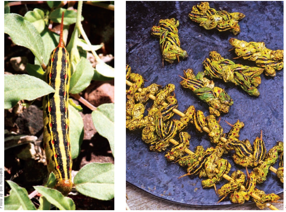
hinx moth caterpillar. Right: White-lined sphinx moth caterpillars roasted and on sticks