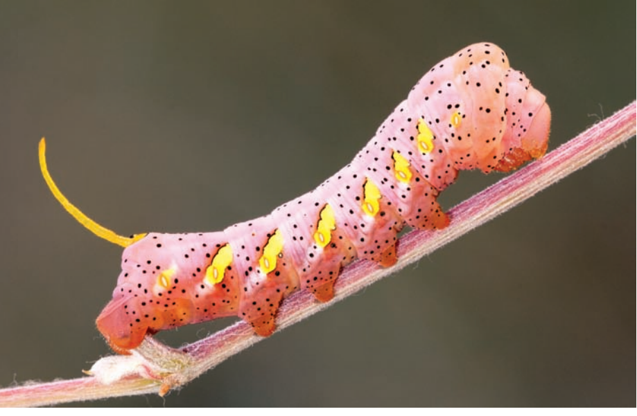
Typhon sphinx moth caterpillar (Eumorpha typhon).

butterflies and moths (Lepidoptera), bees and wasps (Hymenoptera), and true flies (Diptera)—all go through what is known as "complete metamorphosis." In these groups, their life cycle consists of four distinct phases: egg, larva, pupa, and adult. It is thought that the ability to exploit different environments and food sources during different life stages has given insects greater opportunity to specialize and diversify.