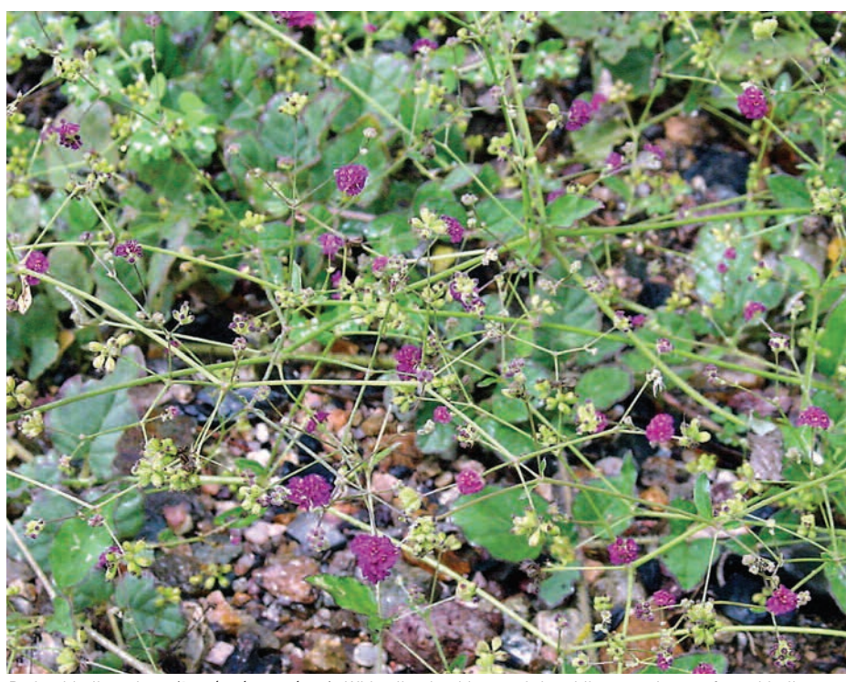
Red spiderling plant (Boerhavia coccinea). White-lined sphinx moth hatchlings tend to prefer spiderling plants to forage on.