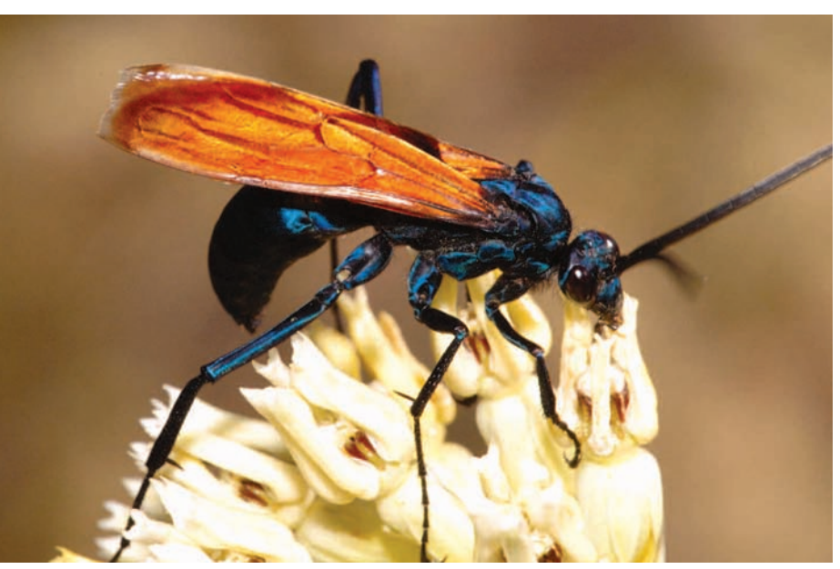
Tarantula hawks (Pepsis spp.) are wasps that feed on nectar and pollen as adults. The larvae feed on tarantulas. After mating, female wasps lure a tarantula out of its burrow by creating vibrations on its silk web. Then the female stings the tarantula, paralyzes it, and drags it to another burrow that she has dug. She then lays an egg on the tarantula's body, which the baby wasp slowly consumes as it matures.