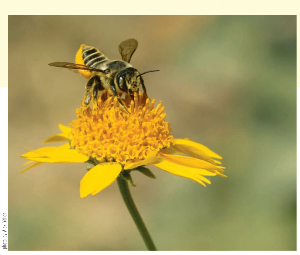
A bee (Megachile sp.) collecting pollen. Bees are some of the most important pollinators.

resistance more quickly than vertebrates. It's an evolutionary arms race. Plants develop new toxins; insects develop new antidotes. In the race, though, most insects drop by the wayside; few species can adapt to all toxins of all plants. The result is that out of the tens of thousands of herbivorous species that might occur in a given region, most plants have only a few insects that can eat them. And therein lies another source of specialization leading to increased biodiversity: an insect that has resistance to a particular plant's toxins secures for itself a nearly exclusive food source (while the plant can survive the limited herbivory from this one or few species of insects). As an example, one common desert plant, the creosotebush ( Larrea divaricata tridentata ), has some 60 species of insects that are specifically associated with it. But you'll probably never see one of these shrubs heavily impacted by insect herbivory, because only a few of those insects are adapted to actually consume creosotebush. The arms race is in balance.