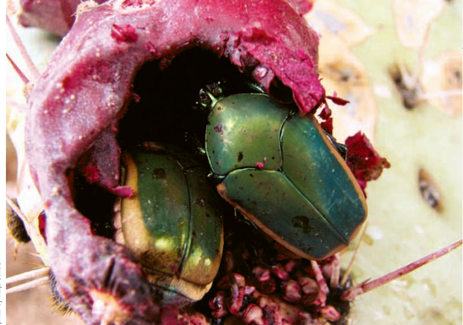
Green fig beetle (Cotinus mutabilis) eating prickly pear fruit.