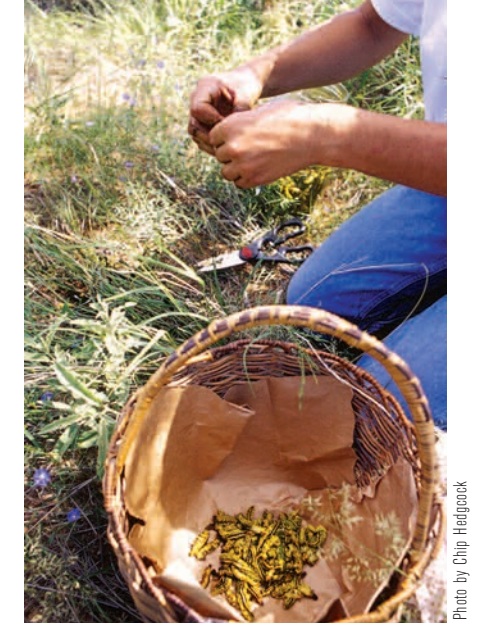
Harvesting white-lined sphinx moth caterpillars.

braided and hung in the sun, or placed on heated stones to dry. They were relished as a food source, which is not difficult to understand; makkum was a delicious food, seasonally abundant, protein- and energy-rich, for a people subsisting mainly on wild desert plants. Nutritionally speaking, Hyles lineata are exceptional. Not only do the roasted caterpillars contain useful complex carbohydrates that are converted into sugar and absorbed at a slow, healthy rate, they also provide high-quality, complete proteins and fat with a large energy yield. They are a source of calcium, iron, zinc, magnesium, niacin, and riboflavin, too (see Table 1).