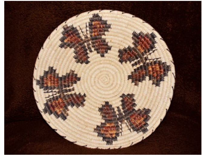
Tohono O'odham basket