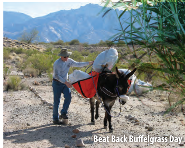
Beat Back Buffelgrass Day

Buffelgrass is a wildfire waiting to happen.