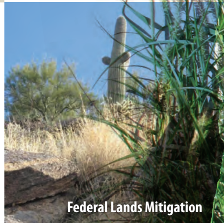
Federal Lands Mitigation