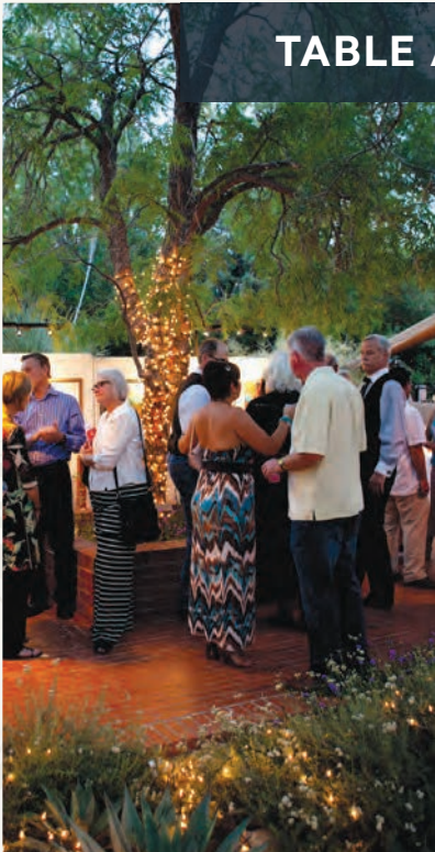
TABLE AMBASSADOR ($2,500; 30 available)